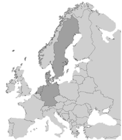
Fig. 1. CINDERELLA project countries

The study focused on incentives widely available for agriculturally used land, mainly agri-environment-climate schemes and other actions supported within the 2 nd Pillar of the CAP, which are co-funded by the European Agricultural Fund for Rural Development (EAFRD). Rural development programmes (RDPs) determine the national implementation of the aims of the 2 nd Pillar of the CAP. To account for differences among countries or regions, the 28 EU Member States elaborated 118 different RDPs for the current funding period (2014-2020) 1 . Next to the large number, language barriers limit accessibility, since RDPs are available only in the corresponding national language. After research on the RDPs of the CINDERELLA project countries Denmark, Germany, The Netherlands and Sweden (Fig. 1), examples of peatland related incentives from other European countries were included for supplementation.