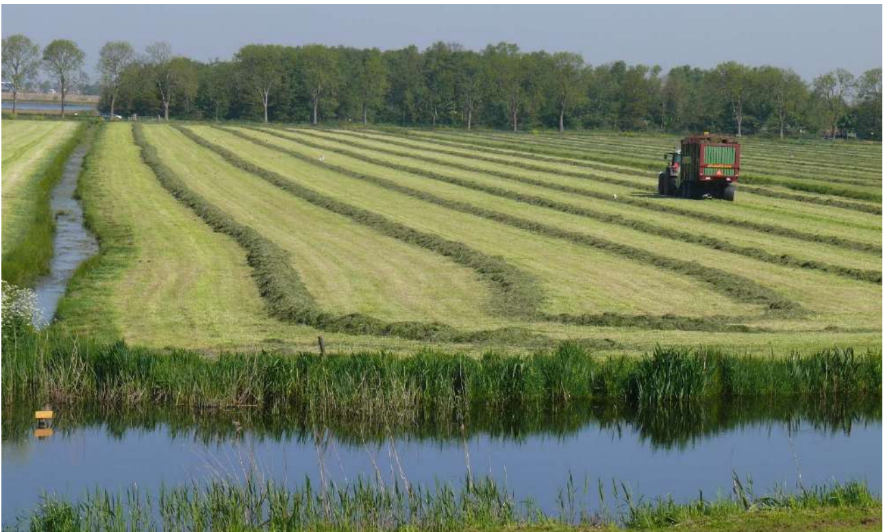
Peatland meadows intensively managed and drained to produce high-quality staple feed for dairy cows and ensure sufficient bearing capacity for heavy machinery.

The conducted survey aimed at disclosing additional examples of economic incentives for wet peatlands or wetlands in Europe as well as information on whom to contact for detailed experiences. Unfortunately, the return was disappointingly limited (n=9). However, answers from e.g. Canada and Southeast Asia (Indonesia and Laos) indicated that economic incentives for improving the provision of peatland ecosystem services are a hot topic all over the world and there is a need for further exchange. Not only the availability of information is limited, but indeed also few good practise examples are in place.