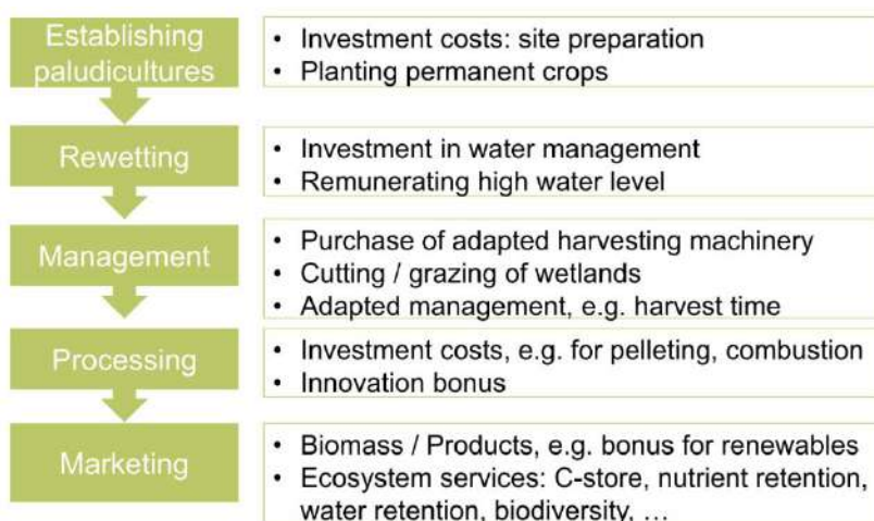
Fig. 2: Incentives for the management of wet peatlands can focus on any point of the production chain from site preparation to marketing of products and ecosystem services.